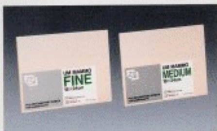
UM MAMMO Screens