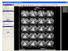
State-of-the Art Film Digitizing Solution

Improve patient care by reducing report turnaround — reduce cost by utilizing hospital PACS infrastructure & personnel